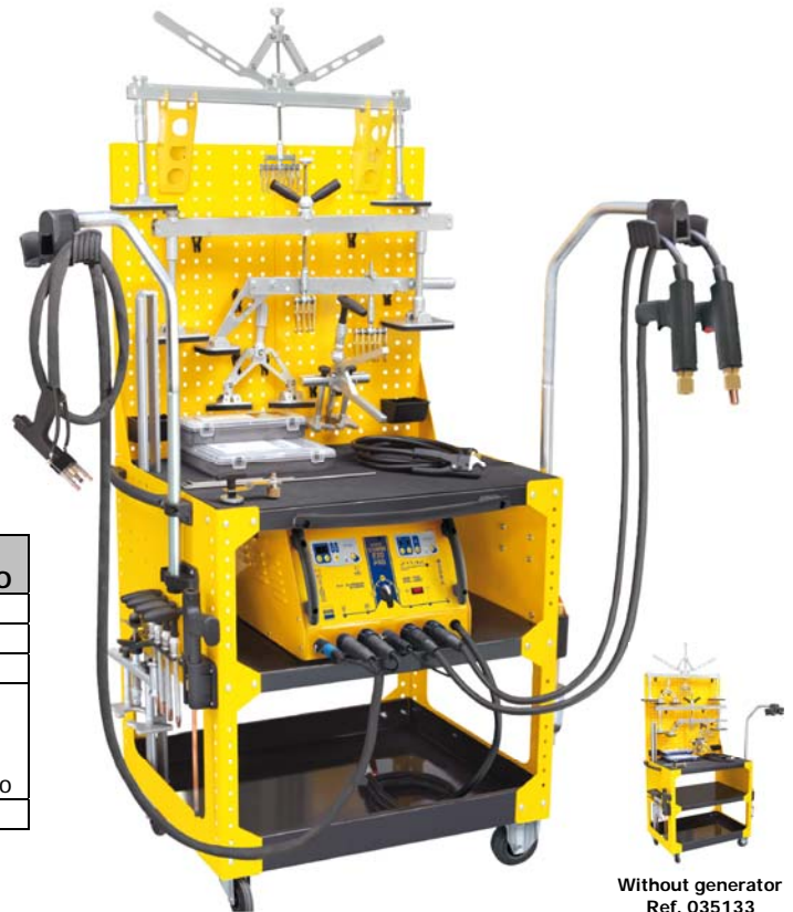
Without generator Ref. 035133

Sill straightening : 30 mn instead of 3 h