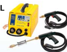
Gysliner PRO 230 - ref.035119 Gysliner PRO 400 - ref.035126