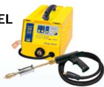
Gysliner 39.02 - ref.035096 Gysliner 39.04 - ref.035102