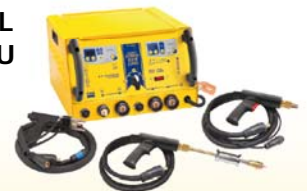
Gysliner Combi 230 E Pro - ref.035089