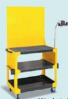
Workstation Ref. 050747