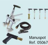
Manuspot Ref. 050679